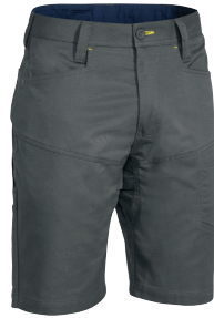
BSH1474 RIPSTOP WORK SHORT