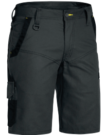
BSHC1130 FLEX & MOVE™ STRETCH CARGO SHORT