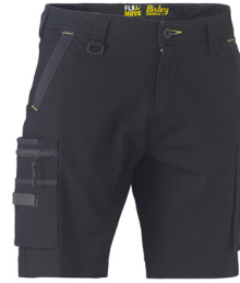
BSHC1330 FLEX & MOVE™ STRETCH UTILITY ZIP CARGO SHORT